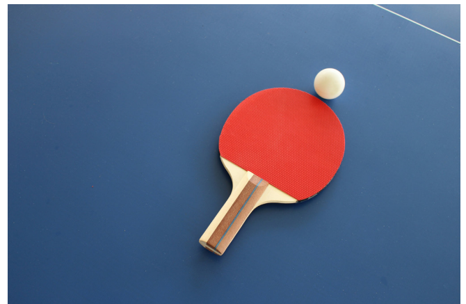
TABLE TENNIS TABLE

All playing standards are welcome as pairs will be grouped at a similar level initially. ■